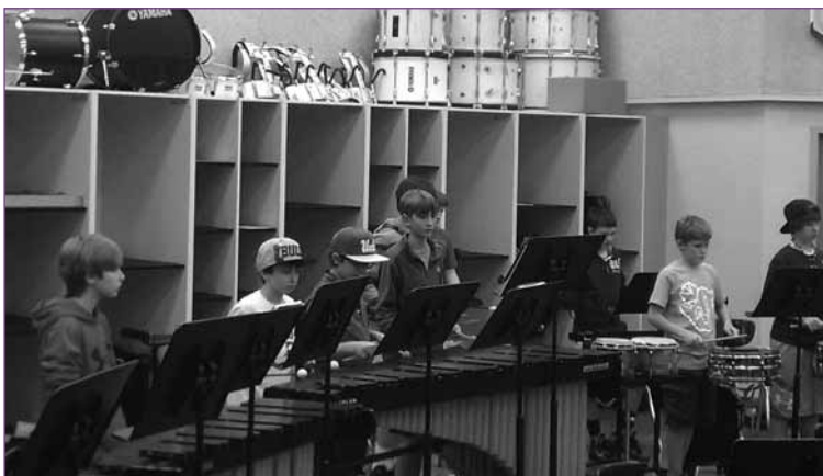
The new marimba at the middle school enhances the percussion section.