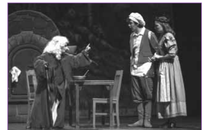
The Foundation was the lead sponsor of Into the Woods, the spring musical at the high school.