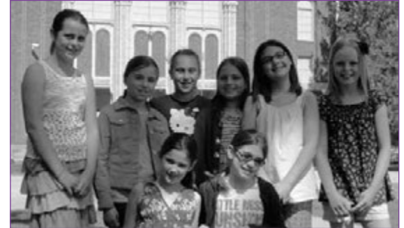
Many students got involved with the EGRNOW! campaign.

We know how important our school system is to the East Grand Rapids community, our students and our alumni. Especially in these times of uncertain education funding, community support is crucial in maintaining the quality of the East Grand Rapids Public Schools. Fully educating and developing our students is critical to the high quality of our schools, as well as maintaining EGR property values. A huge thank you goes out to our community for everyone's efforts!