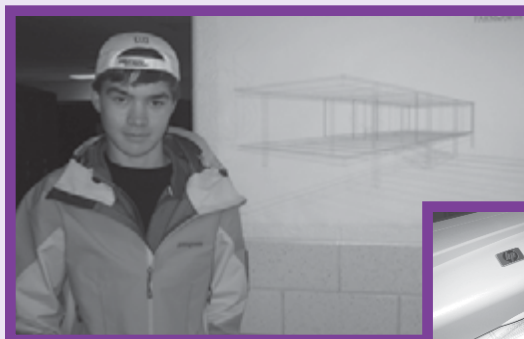
CAD plotter enhances Drafting, Design & Technology courses at the high school.