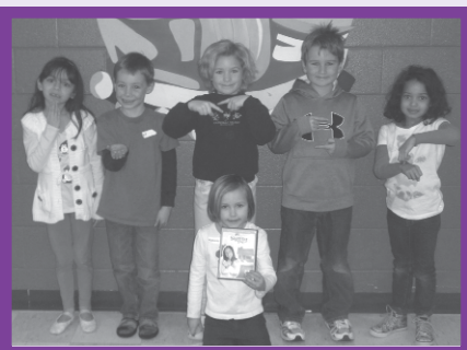
First grade students use sign language to say, "Thank you for Signing Time," a component of our Champions of Diversity program.