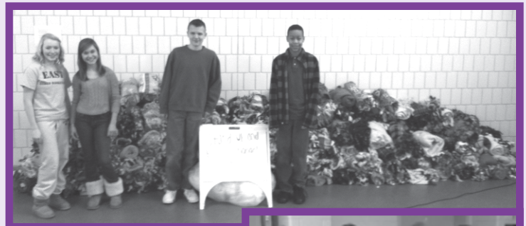
Middle school students made over 300 blankets for families in need as part of the Martin Luther King Day celebration.