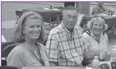
Class of 1961