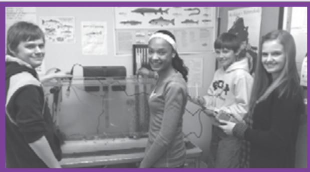
New science probes at the middle school allow the students to monitor water quality and enhance their weather unit.