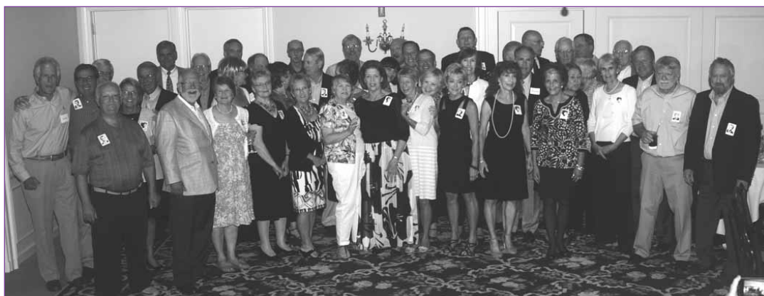
The Class of '63 Celebrates their 50th reunion