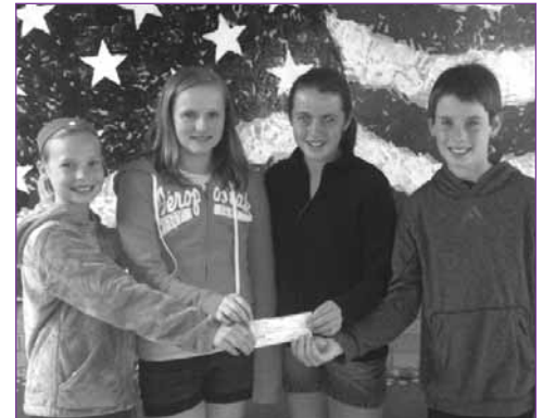
Many students participated in the EGRNow! campaign.