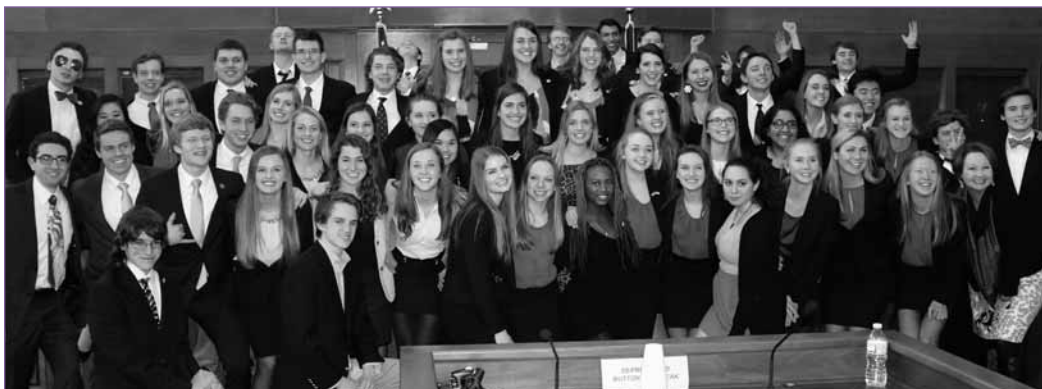
Congratulations to the 2015 We The People State Champions! Good luck at Nationals.