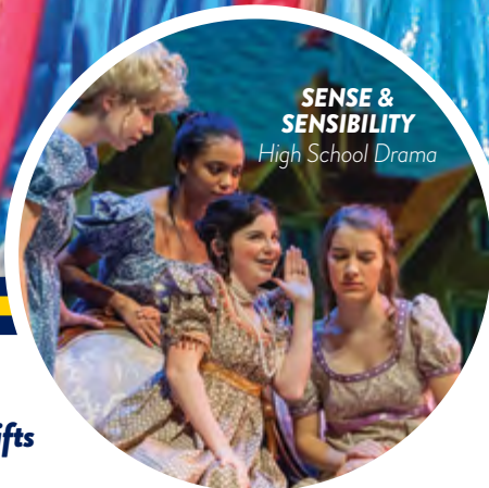
SENSE & SENSIBILITY High School Drama