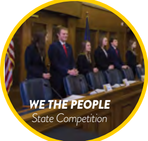
WE THE PEOPLE State Competition