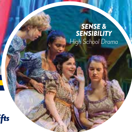
SENSE & SENSIBILITY High School Drama