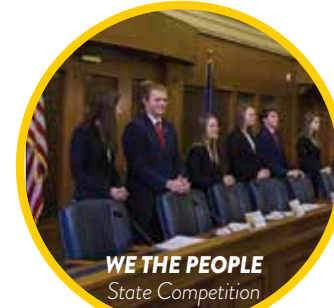
WE THE PEOPLE State Competition